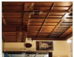
01 May 2020 Sunday chapel service - Sunday 10th May 2020 - VE Service Digital Sunday services from Angpath School Chapel