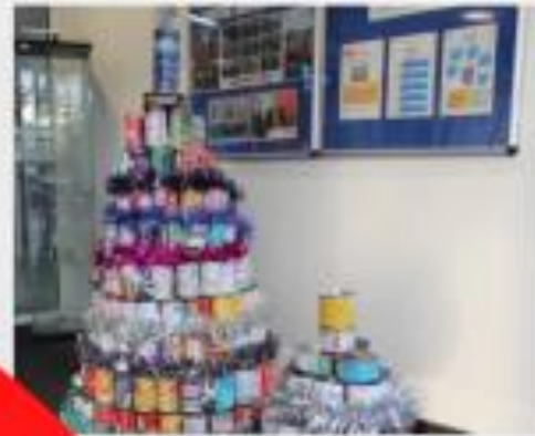
OUR CHRISTMAS TREE 2020

Tins can include - spam, ham, corned beef, tuna, stew, meatballs, pasta, hot dogs, pies, custard, rice pudding, potatoes, beans, soup, vegetables, tomatoes.