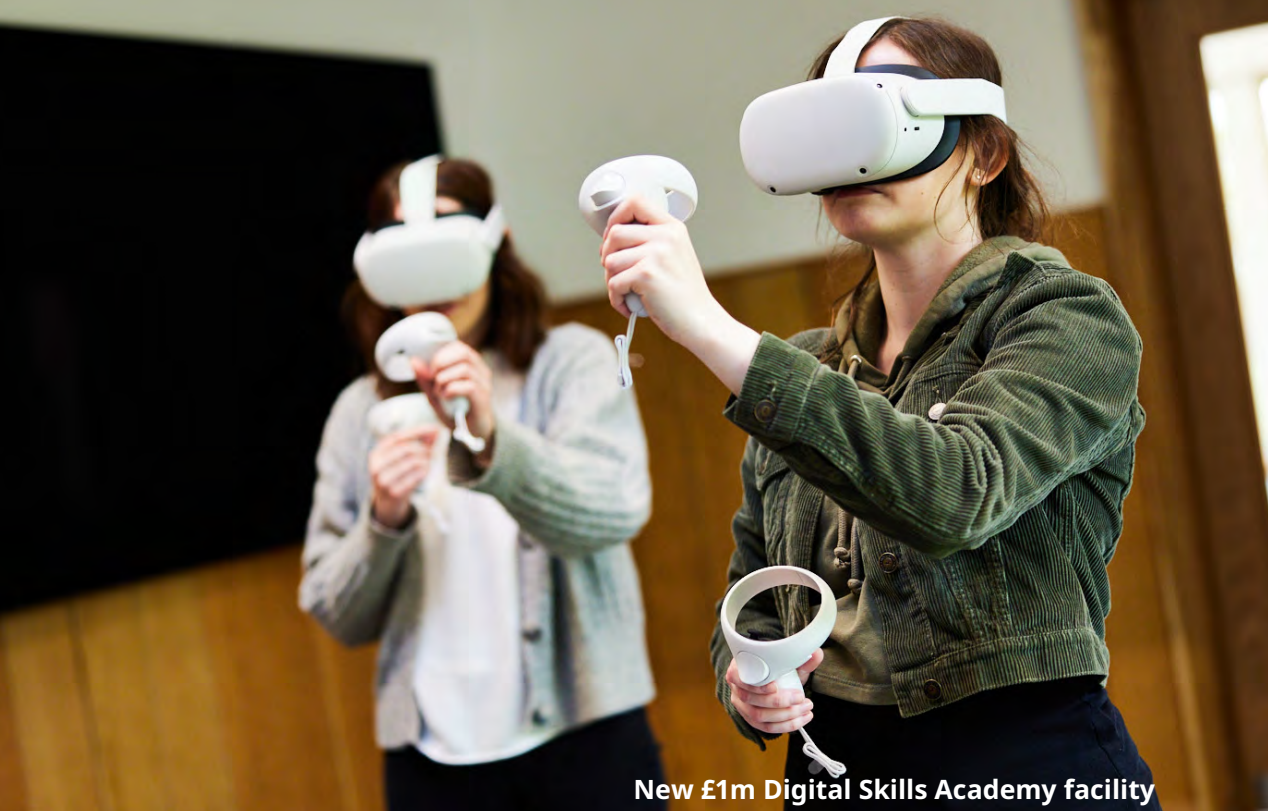
New £1m Digital Skills Academy facility